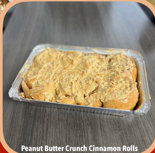
Peanut Butter Crunch Cinnamon Rolls