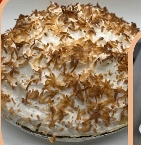
Coconut Cream Meringue Pie